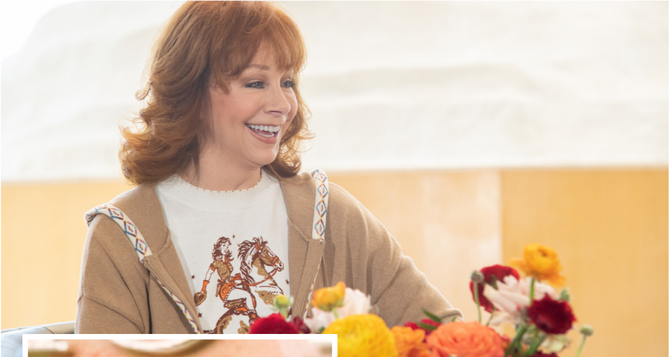
Reba McEntire, 2024 Lifetime Achievement Award Recipient